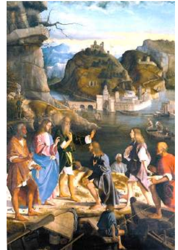
Artwork: "Calling the sons of Zebedee" Artist: Marco Basaiti (1470–1530)

Mark's Gospel is told with a great sense of urgency and immediacy. Jesus is a person of action, and events occur in rapid succession. We see this in today's Gospel. Time is of the essence; the fishermen immediately put aside their livelihood to become Jesus' disciples. The Kingdom of God is here and now. The time of fulfillment is at hand. How might our lives be different if we more fully shared this sense of the immediacy of God's kingdom?